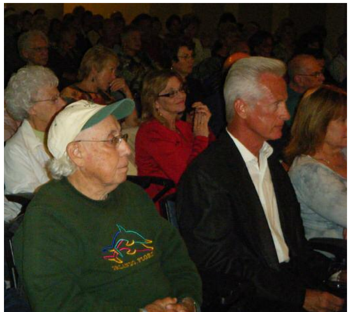
A typical Friday Night Jazz Crowd.